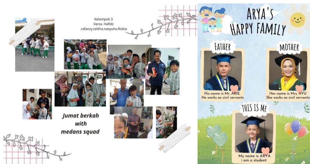
Figure 3. photo collage examples

In this case, we can know that the use of canva applications in ICT learning media is very useful. Both in the introduction of technology and fostering student creativity. It is an application that is suitable for use in the realm of education and any level, even elementary schools can learn it, besides being easy and practical to use anywhere. With this research, researchers hope to contribute that we can teach ICT learning for elementary school children, using exciting and interesting learning media, one of which is the Canva application.