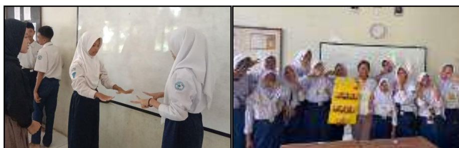
Figure 2. Numeracy skills activities in the calistung studio