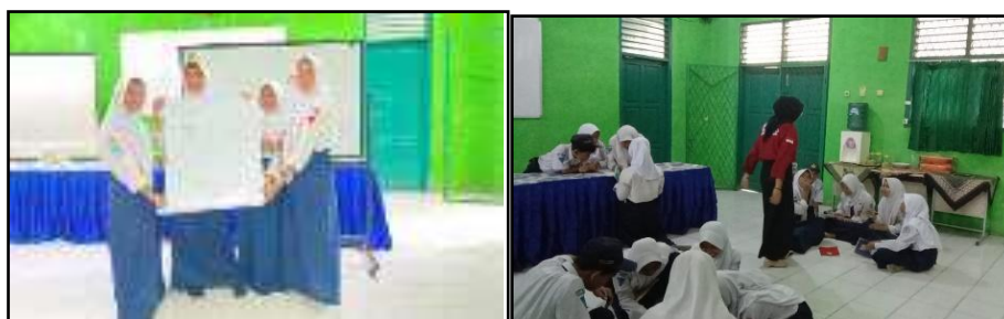
Figure 1. Literacy skills activities in the calistung studio