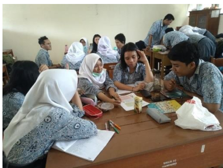
Figure 1. Students identify Problem on their work sheet actively

Further analysis was about students activities during IA lessons and SA lessons. Students performed good performance and participated the lessons, such as they work together to identify the problem actively (Figure 1), one of the groups presented the results of the answer in front of the class (Figure 2).