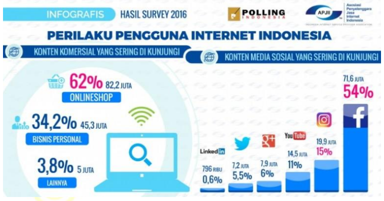
Source: Association of Indonesian Internet Service Providers (APJII) Figure 2. Indonesian Internet User Behavior in 2016

spend at least once a month. Based on data released by the TNS Indonesia E-Commerce Survey in 2014, it appears that online shopping behavior of internet users in Indonesia is very compatible with the characteristics of handmade products because 78% of items purchased are fashion (eg clothing, bags, shoes, accessories and others).